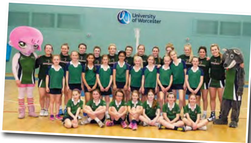
Girls from all three schools took part in the Superball evening

Congratulations to the girls for winning the Challenge Cup