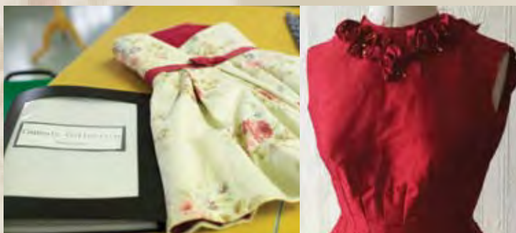
Edward's designs and creations