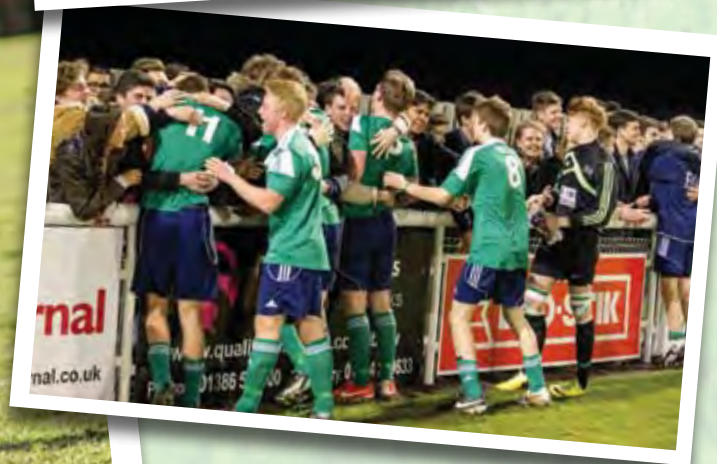
1st XI success at Evesham United in March