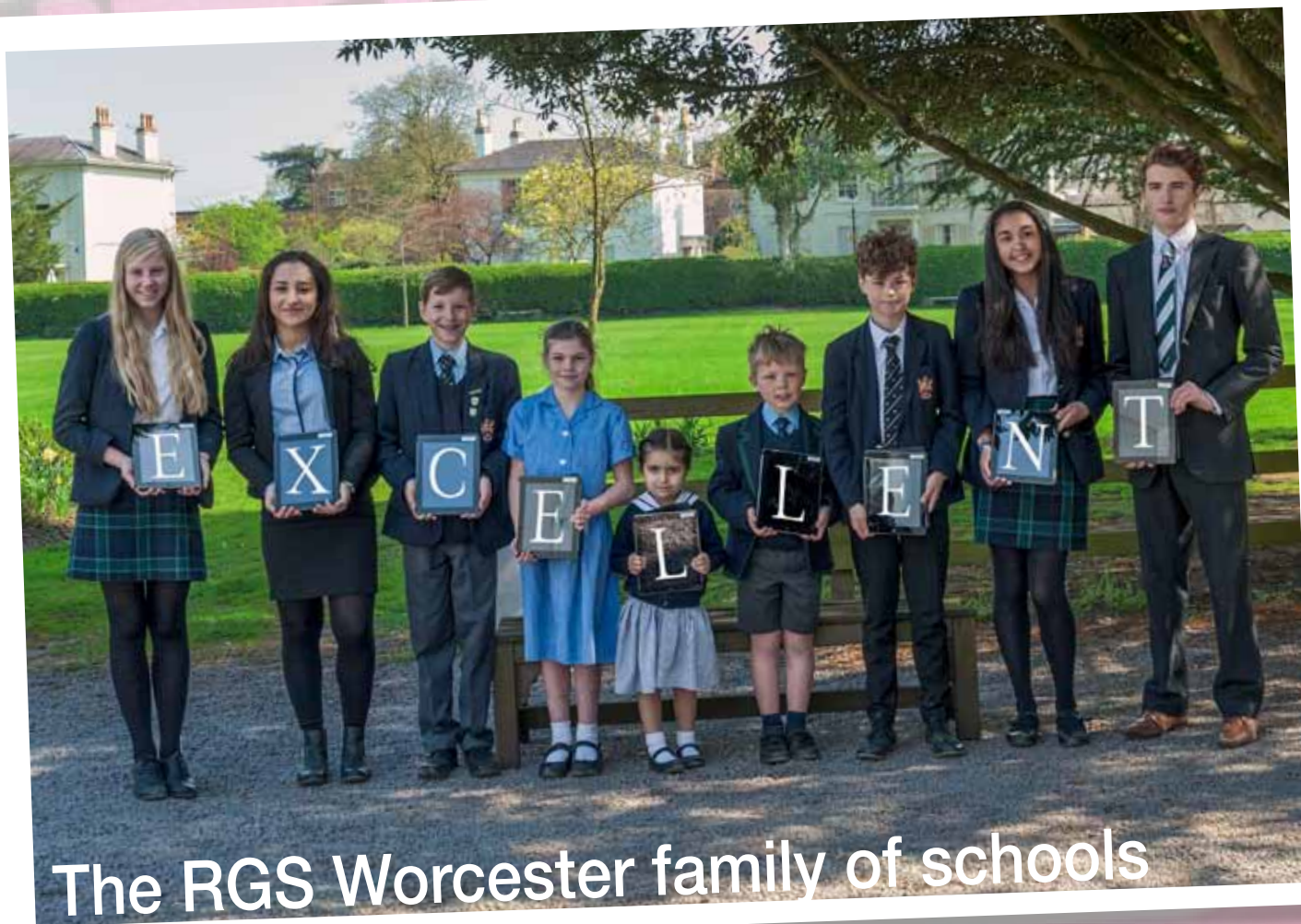
The RGS Worcester family of schools