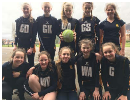
Year 8 District Netball Winners