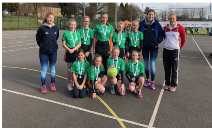
Year 7 Netball Runners Up @SchoolGames

The girls are continuing to accumulate credits with 8 Prep. pupils having achieved their Gold certificate already - Well done!